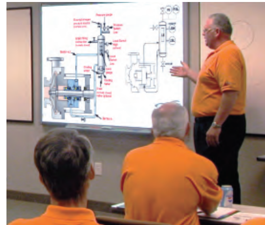
Education & Training