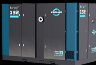
Rotary Screw Oil-Free